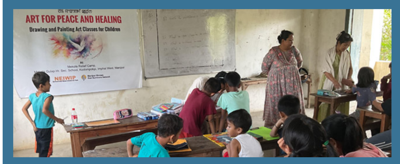
Art for Peace and Healing - Drawing and Painting Art Classes for Children at Mekola Relief Camp, Imphal West, Manipur