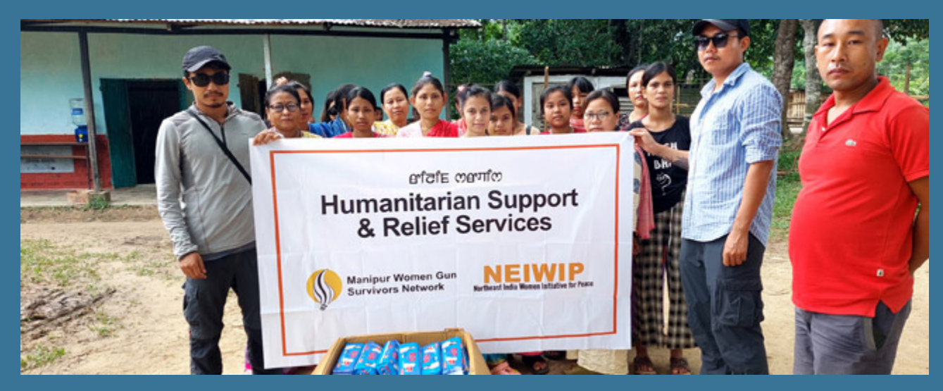
Humanitarian Support & Relief Services, Jiri, Manipur